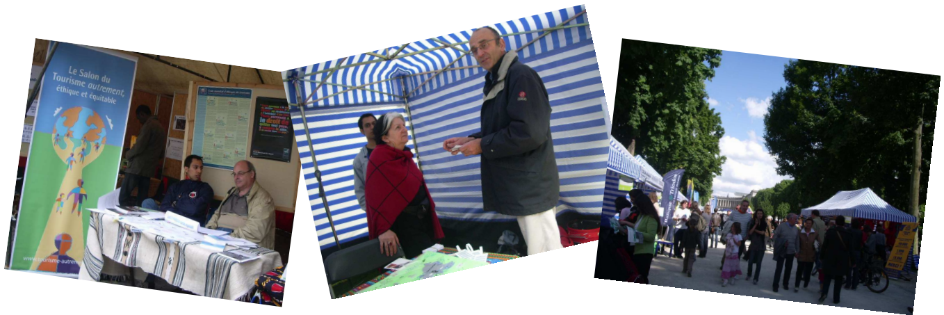
The Environment Party we attended on June 7th

We are also available for trainings (schools or professionals), educational animations or conferences. Feel free to contact us at: info@tourisme-autrement.be